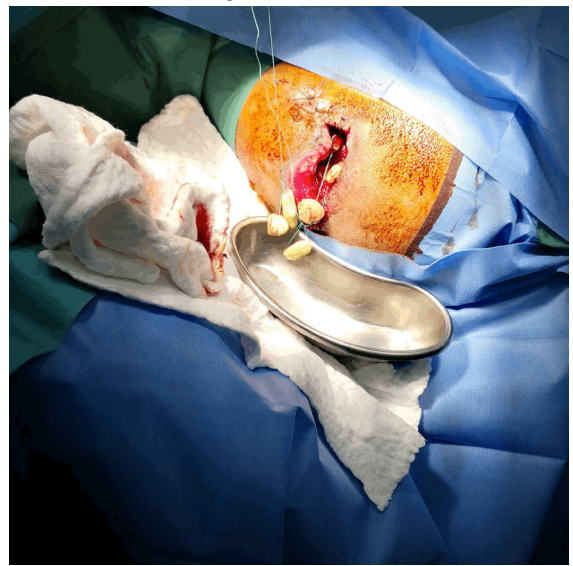
Figure 5: In the third operation, insertion of the antibiotic-impregnated beads in the right hip dead space.

Figure 4: In the second operation insertion, the antibiotic-impregnated beads in the left hip.