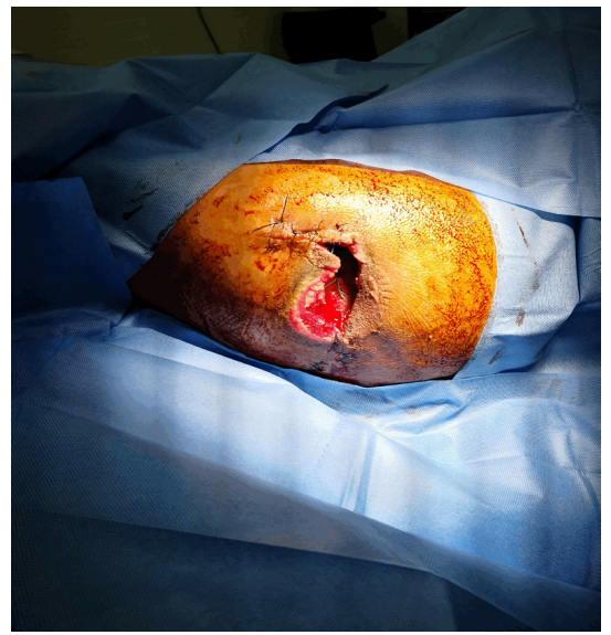
Figure 1: First surgical closure of wounds after the resolution of infection.

In November 2019, the patient was admitted to the hospital with three infected pressure sores (Stage 4) and a high-grade fever (figure 1). In addition, the patient had paraplegia and was wheelchair-bound for four years due to a complete spinal cord injury at the T11 level.