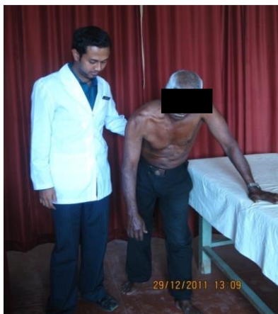
FIGURE 5: SHOULDER PENDULAR EXERCISE

Basic Pendular Exercise: Patient used a chair or table for this exercise Patient leaned forward so that his back was near parallel to the floor and his hands were on the back of the chair. The patients firmly gripped the chair with the non affected hand and slowly brought the affected arm down so it hanged freely. Once in this position, the patients slowly swing his affected arm forward, backward and from side to side. These exercises were done in repetition of eight times by the affected hand.