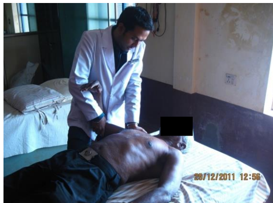
FIGURE 1: ANTERIOR- POSTERIOR GLIDE TO GLENOHUMERAL JOINT

End-Range Mobilization:- The technique started with warm up of mid range mobilization with patient in supine. The therapist places his hand on the glenohumeral joint and humerus was brought to position of maximal flexion in sagittal plane. 10-15 repetitions of Maitland mobilization grade 3 or 4 was given in this end range position. Maitland mobilization includes the anterior-posterior glide, posterior-anterior glide and inferior glides respectively. This treatment was given 2 times per week for a period of 4 weeks.