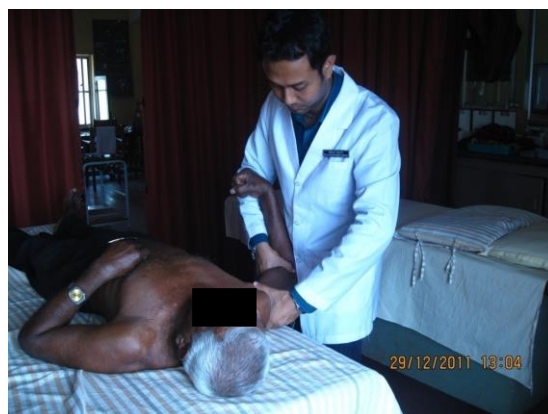
FIGURE 2: INFERIOR GLIDE TO GLENOHUMERAL JOINT