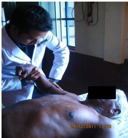
FIGURE 4: PNF TECHNIQUE FOR INTERNAL ROTATORS “CONTRACT RELAX”

actively move through the PNF flexion-abduction external-rotation diagonal pattern for 5 repetitions with manual facilitation. This treatment was given 2 times per week for a period of 4 weeks.