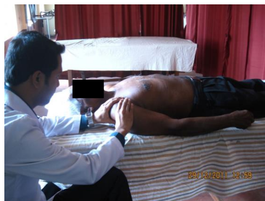
FIGURE 3: POSTERIOR- ANTERIOR GLIDE TO GLENOHUMERAL JOINT

Contract-relax PNF technique:- Patient in supine with humerus was abducted to approximately 45 degree with the elbow flexed to 90 degree, the humerus was externally rotated to a midrange of 20 to 25 degrees. The patient was instructed to perform maximal glenohumeral internal rotation against an opposing, isometric, manual resistance applied by the treating therapist for 7 seconds. Afterwards the patient actively moved the humerus into full available external rotation. This position was maintained for 15 seconds. This 7 sec internal rotation contraction against resistance followed by full active external rotation was repeated 5 times. Subjects were then instructed to