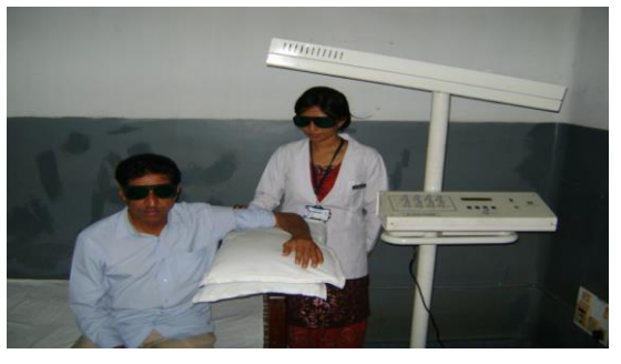
Figure 3: LLLT for tennis elbow.