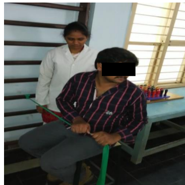
2.2: TRUNK TWIST