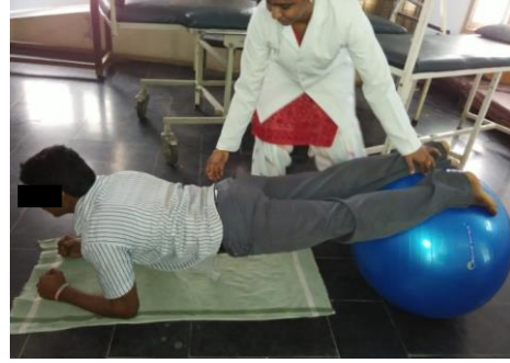
1.2: PLANK EXERCISE