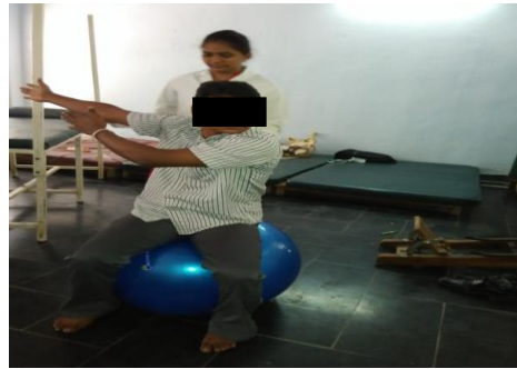
1.4: SPINE ROTATION