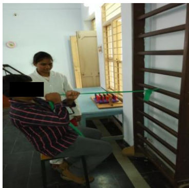
2.3. BACK EXTENSION