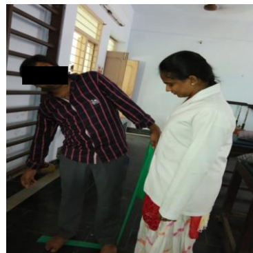
2.4: SIDE BEND