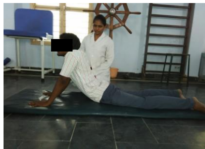
3.4: PRONE ON HANDS