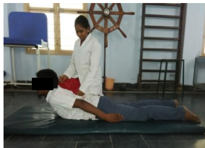
3.2: BACK EXTENSION