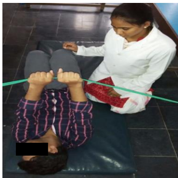
2.1: TRUNK CURL UP