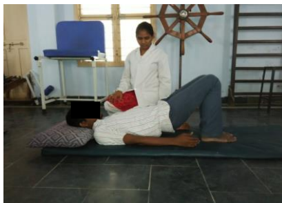
3.3: PELVIC TILT