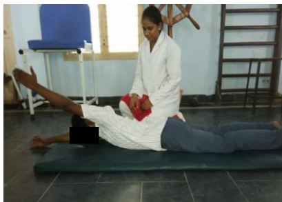
3.1: ARM LIFTS