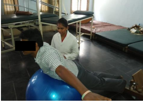
1.1: BACK EXTENSION