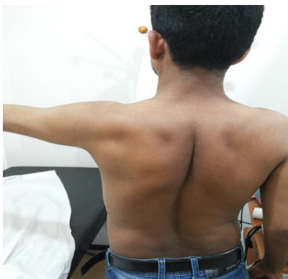
Figure1: Posterior view showing medial border of scapula protruding outwards during lowering arm from abduction above 90 degree down due to lack of control of Serratus Anterior and lower trapezius muscle-showing Type 2 scapula dyskinesia

Rhythmic stabilization exercises, Thera band exercises (Red Color) were implemented as follows- Scaption, standing boxer punch, standing dynamic hug, Bilateral external rotation with abduction 0 degree, rowing exercises were given.