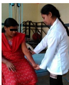
Figure 1: Stretching position for ECRB

Procedure of intervention for Study group: Received Medial to lateral taping with exercise programme. The tape used in the study was non-elastic, 3.8-cm wide zinc oxide tape with adhesive backing and high tensile strength. The subjects were asked to rest the elbow in supported position where elbow was slightly in flexion and pronated and wrist in extended position to contract the ECRB. The tape was applied on the proximal forearm 3 cms distal to the lateral epicondyle, starting medially and ending laterally parallel to the wrist line. 2 or 3 anchors of tape was applied. The tape is tightened until the subject agrees that it snug's during a contraction of the wrist extensors, but not impeding blood flow. The tape applied be comfortable when the wrist extensors was relaxed.