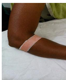
Figure 2: Medial to lateral taping