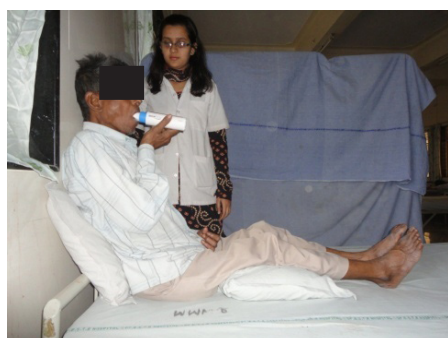
Figure 3: Long sitting