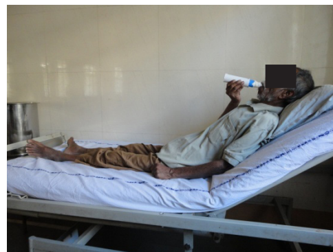
Figure 4: Semi fowler's Position