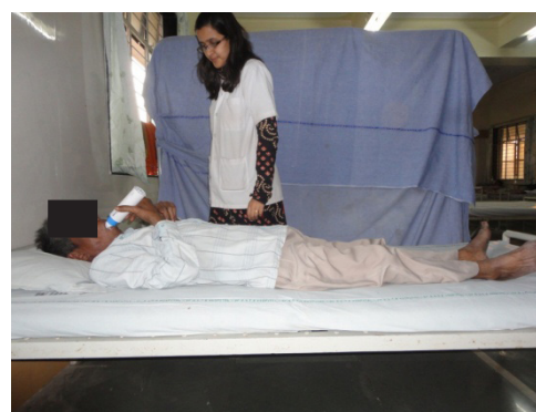
Figure 5: Supine Lying