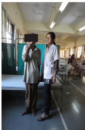
Figure 1: Standing

Each subject was placed into the first randomly drawn position and allowed to rest for three minutes. Following this the subject perform three tests of PEFr with as much as rest as desired by the subject between each trial. Testing would be terminated if the subject withdrew consent, became short of breath, was too fatigued to continue, could not tolerate the position or was unable to perform the test correctly in that position. The data used in analysis is the mean of the three values obtained in each position.