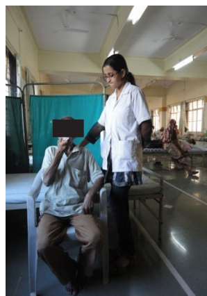
Figure 2: Chair Sitting