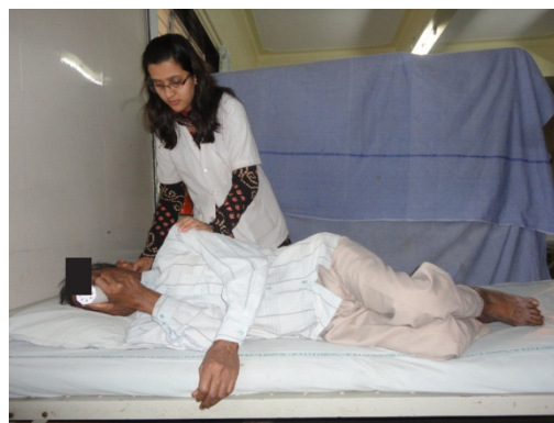
Figure 6: Side Lying