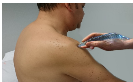
Figure 1: Astym therapy application

A sample of 60 diabetic patients were diagnosed with chronic RC tendinopathy by referring physician, were selected from outpatient clinic of the military hospital. Eligibility criteria were: age between 30-55 years, diagnosis of type II diabetes more than 2 years ago, all patients had <12% on their most recent (HbA1c) test (through last 3 months) and the blood glucose level ranges between 100 - 250 mg/dL at the time of study engagement [18], minimum six-month period of painful shoulder, tenderness over the glenohumeral joint region , +ve empty can test, pain with one of the resistance tests: abduction, external rotation, internal rotation or flexion, painful arc with active abduction or flexion. Exclusion criteria include: history of frozen shoulder, shoulder instability, calcified tendonitis, shoulder surgery and/or radiated cervical pain. also patients who received physical therapy program within last 3 month were not allowed to participate in this study.