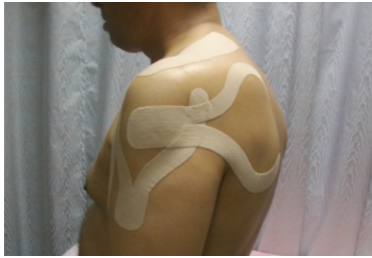
Figure 2: kinesiotaping application

After informed consent and base line assessment, patients were assigned by a random-number generator to one of two intervention groups through concealed allocation : Astym therapy group (n=28) and Kinesiotaping group (n=28) fig 3. Patients were asked to decline any additional form of treatment for their shoulder during the course of the study .Also they were instructed to maintain current levels of medication and not to begin any new medications. All participants received conventional physical therapy program for shoulder pain, that include: hot packs for 20 mint/session and exercises in the form of strengthening exercises for the trapezius, serratus anterior and shoulder external rotation in addition to stretching for pectoralis muscles two times a week for 12 weeks.