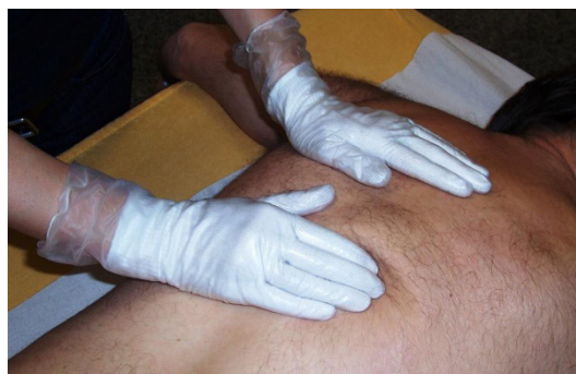
Figure 1: Single use gloves made of polyvinyl chloride with cotton gloves worn underneath in a standard massage.

The main reason physiotherapists give for their reluctance to wear protective gloves is their belief (which is usually an untested assumption on their part) that patients will not accept the use of protective gloves during treatment [12]. So the two main aims of this two-part study were: