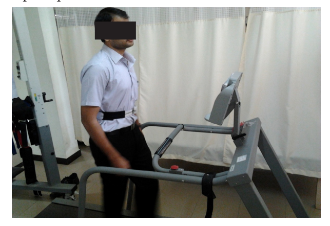
Figure1: Gait assessment-with abdominal drawing maneuver statistical analysis

then can be displayed on the display. The post test pain percentage levels are assessed using Revised Oswestry low back pain questionnaire.