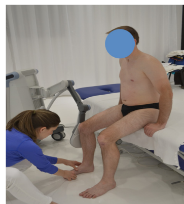
Picture1: Application of Treatment

The goal of this study was to evaluate the anti-spastic effect of high-intensity electromagnetic field stimulation in post-stroke condition. This was a randomized control study, in which 30 patients after stroke (n=19 “Hemiparesa dextra”; n=11 “Hemiparesa sinistra”) participated (mean age 66.93 \pm 9.31 ; 25 women, five men). Patients were assigned to two equal groups – Treatment Group (TG) and Control Group (CG) – of 15 people. Patients with electronic and metal implants, cancer, and blood coagulation disorders were excluded from the study. The Modified Ashworth Scale (MAS) and Barthel Index of Activities of Daily Living (ADL) were used to comparing the results in different time periods.