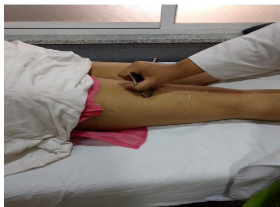
Figure 4: M2T for Hamstring muscle