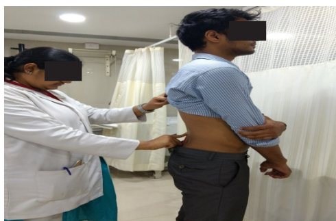
Figure 2: Measuring Lumbar Lordosis

Quebec back pain disability scale is a questionnaire about the way low backache is affecting daily life. Subjects with back problems may find it difficult to perform some of their daily activities. This questionnaire has 20 questions related to activities of daily living and a scale of 0 to 5 for each activity minimum detectable change is 90 % (15 points).