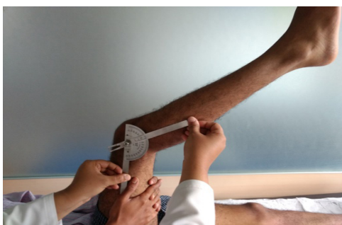
Figure 1: Active Knee Extension Test.

To identify T_{12} , lower back above the iliac crest was palpated; this was the L_4 spinous process. By counting up the vertebrae, T_{12} spinous process was identified. Then, the flexible ruler was placed on T_{12} and S_2 and pressed on the ruler to eliminate the gap between the ruler and the skin. Then ruler was kept on a graph sheet, and the lumbar curve was drawn afterward. Then formula was used to substitute the values and find \theta [9] (Figure 2).