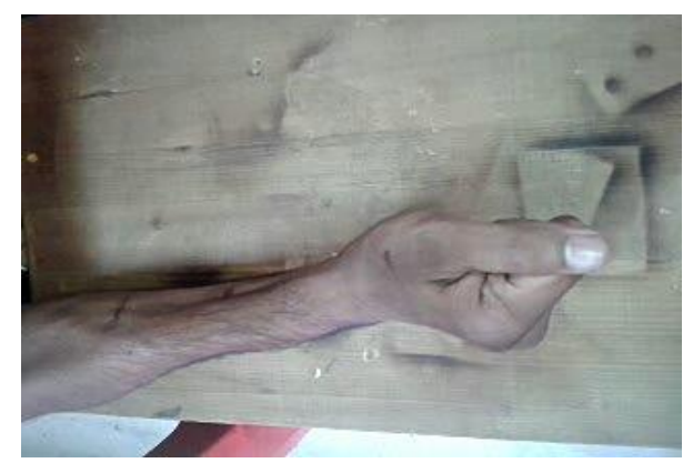
Fig 5: Complete fist