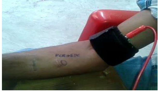
Fig 1: Passive electrode placement