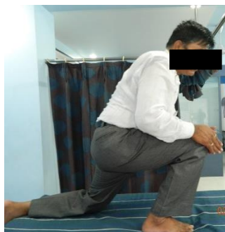
Fig 1. Kneeling iliopsoas stretch

low back. 21 3. Supine piriformis stretch: Subject supine lying on the floor, put one foot up against a wall to provide additional support during the stretch. If not using a wall support, slowly move stretch limb towards chest to apply gentle pressure towards inside of other knee. Stretch force was applied until subject feels a deep stretch in buttock and hip. 21 4. Lower Back Stretching: Stretching for Erector spinae muscle and quadratus lumborum that lie within the layers of the thoracolumbar fascia. This stretching was performed subject in supine position; holding right knee with both hands and pulling it into the chest then again pull the left knee to chest while breathing deeply and holding the position for thirty seconds. 15 5. Hamstring Stretching: The subject was asked to bend their one hip joint at 90° from a supine position and slowly extending the knee joint while supporting the popliteal region with both hands and holding for approximately ten seconds at maximal extension. The position was held for thirty seconds. 15 6. Tensor Fasciae Latae Stretching: Passive stretching of Tensor Fasciae Latae was performed with the assistance of a person, extending and internally rotating the hip joint on the stretched side from a lateral recumbent position and holding for approximately thirty seconds. 15