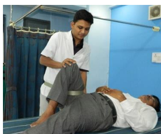
Fig 2. Hip Distraction