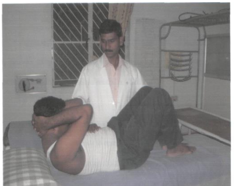
Figure -2: TREATMENT WITH CONVENTIONAL BACK EXERCISES