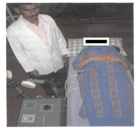
Figure -1: TREATMENT WITH SHORT WAVE DIATHERMY

The Group- A had a mean age of 39.30 with standard deviation of 8.72. Group- B patients had a mean age of 39.05 with Standard deviation of 6.07. There were a total of 22 males and 18 females in all the groups. The data collected was analyzed for homogeneity between the groups and within the groups using ANOVA table holding control group as the defining variable. It was shown that all the values calculated had a significance greater than p=0.05 and hence the data are considered homogenous for all the outcomes measured