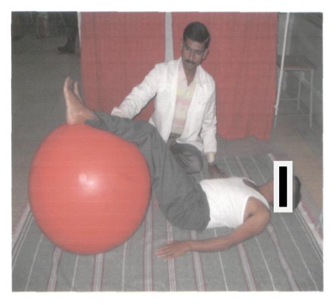
Figure - 3: TREATMENT WITH CORE STABILIZATION EXERCISE

Data Analysis for significance of improvements between the groups