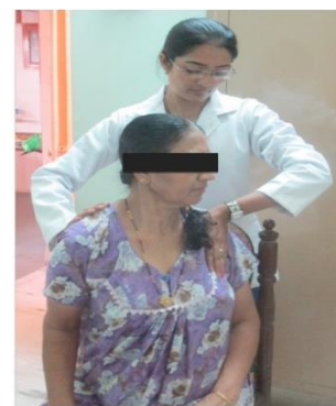
Figure-3: Trunk rotation