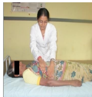
Figure-1: Rib rotation in supine lying