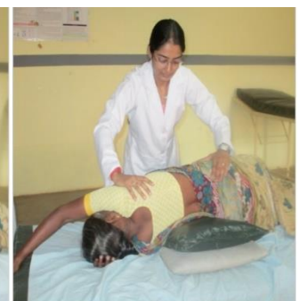
Figure-2: Side stretch on pillows