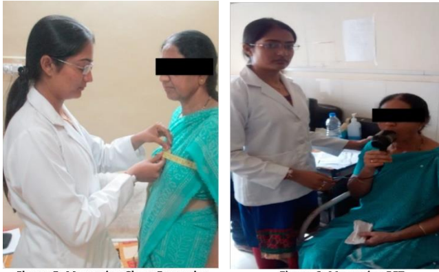
Figure-5: Measuring Chest Expansion