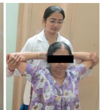
Figure-4: PNF Hold-relax Stretching