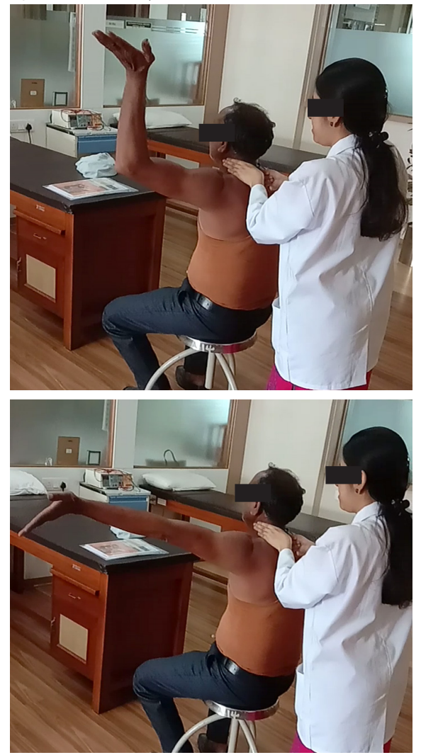
Figure 3: Neurodynamic Spinal Mobilization with Arm Movement for median nerve (start and end positions)

Figure 2: Neurodynamic SNAGs for cervical flexion