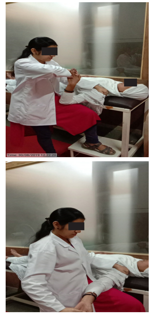
Figure 4: Conventional neural mobilization for median nerve (start & end positions)

muscle stretching (30 sec hold with rest for 30sec) [9], Neck isometrics [10], Scapular retractions (3 sets in a day with 10 repetitions of each exercise) [11], chin tucks [4] and Manual traction to the cervical region. In addition, the participants were instructed to report any dizziness, cervical pain, or other symptoms during the application of the treatment to ensure the treatment remained symptomfree.