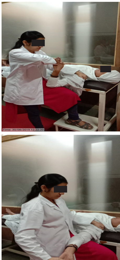
Figure 4: Conventional neural mobilization for median nerve (start & end positions)

muscle stretching (30 sec hold with rest for 30sec) [9], Neck isometrics [10], Scapular retractions (3 sets in a day with 10 repetitions of each exercise) [11], chin tucks [4] and Manual traction to the cervical region. In addition, the participants were instructed to report any dizziness, cervical pain, or other symptoms during the application of the treatment to ensure the treatment remained symptom-free.