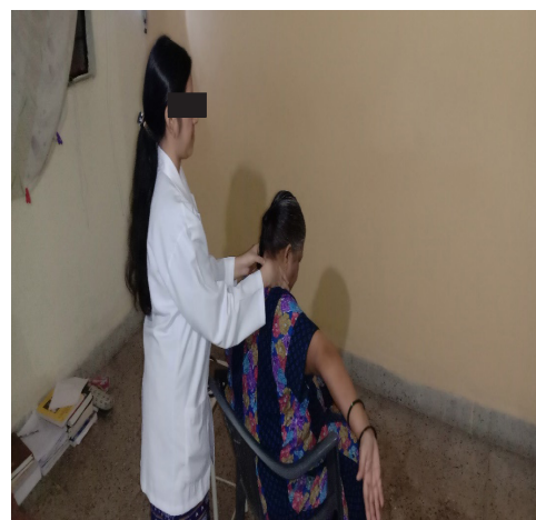
Figure 2: Neurodynamic SNAGs for cervical flexion

In the neurodynamic SNAGs technique, subjects (n=15) sat on a chair; the therapist placed the medial border of distal phalanx of one thumb under the facet joints of the affected level and pulp of another thumb on the lateral side of previous thumb superimposing it. The affected arm is kept in a neurodynamic test position below the pain limit, and a glide was given over the facet joint by pushing it towards the eyeball. The patient was asked to actively perform certain specific neck movements (neck flexion/side-flexion to opposite side/rotation to same side) to facilitate the opening of the foramen. The therapist moved their hand along with the movement of the spine to sustain the glide (Fig.2). In Neurodynamic Spinal Mobilization with Arm Movement, the therapist approached the affected level of the spinous process from the medial aspect of the thumb of one hand, which was reinforced by the index finger of the other hand. Pure transverse glide was given from the affected to the unaffected side. While the glide was sustained, the patient performed the desired neurodynamic movements actively & just below the pain limit (Fig.3) [6]. Adequate soft tissue slack must be taken & then force should be applied in the desired direction to make the glide effective. The glides had been given for three repetitions, three sets for five consecutive days.