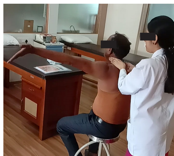
Figure 3: Neurodynamic Spinal Mobilization with Arm Movement for median nerve (start and end positions)